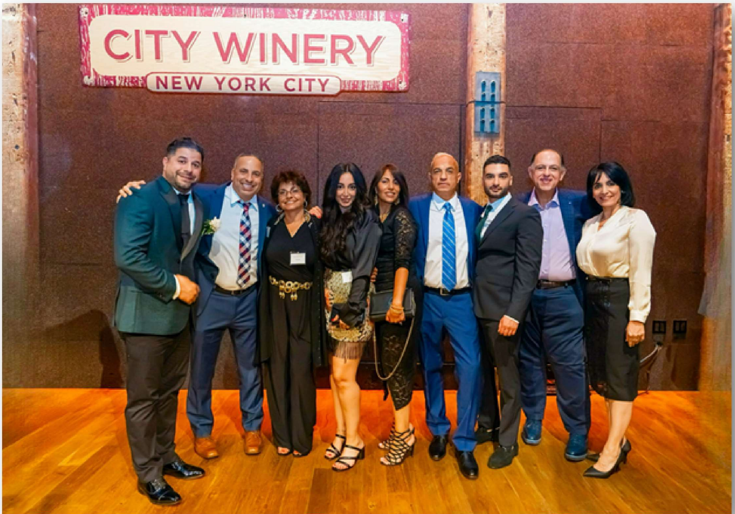
My Family In Attendance