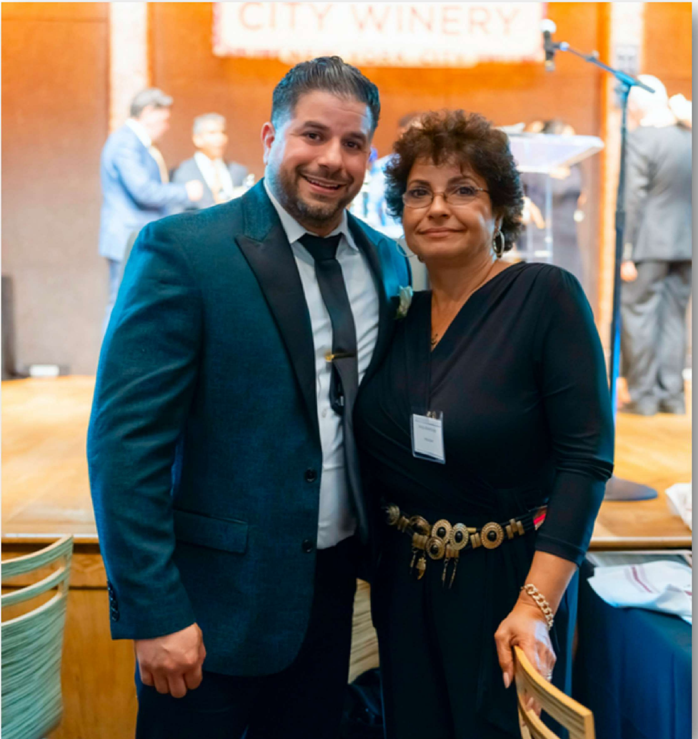
Me and my Mother