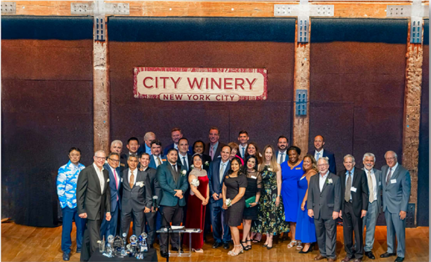
Current Board, Associate Directors, Former Presidents, and ISACA Global Leadership