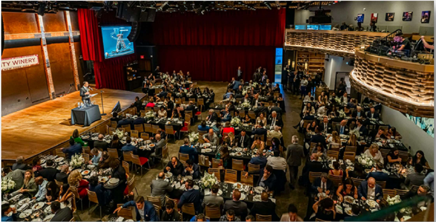
Wasserman Award Recipient Speech to Membership