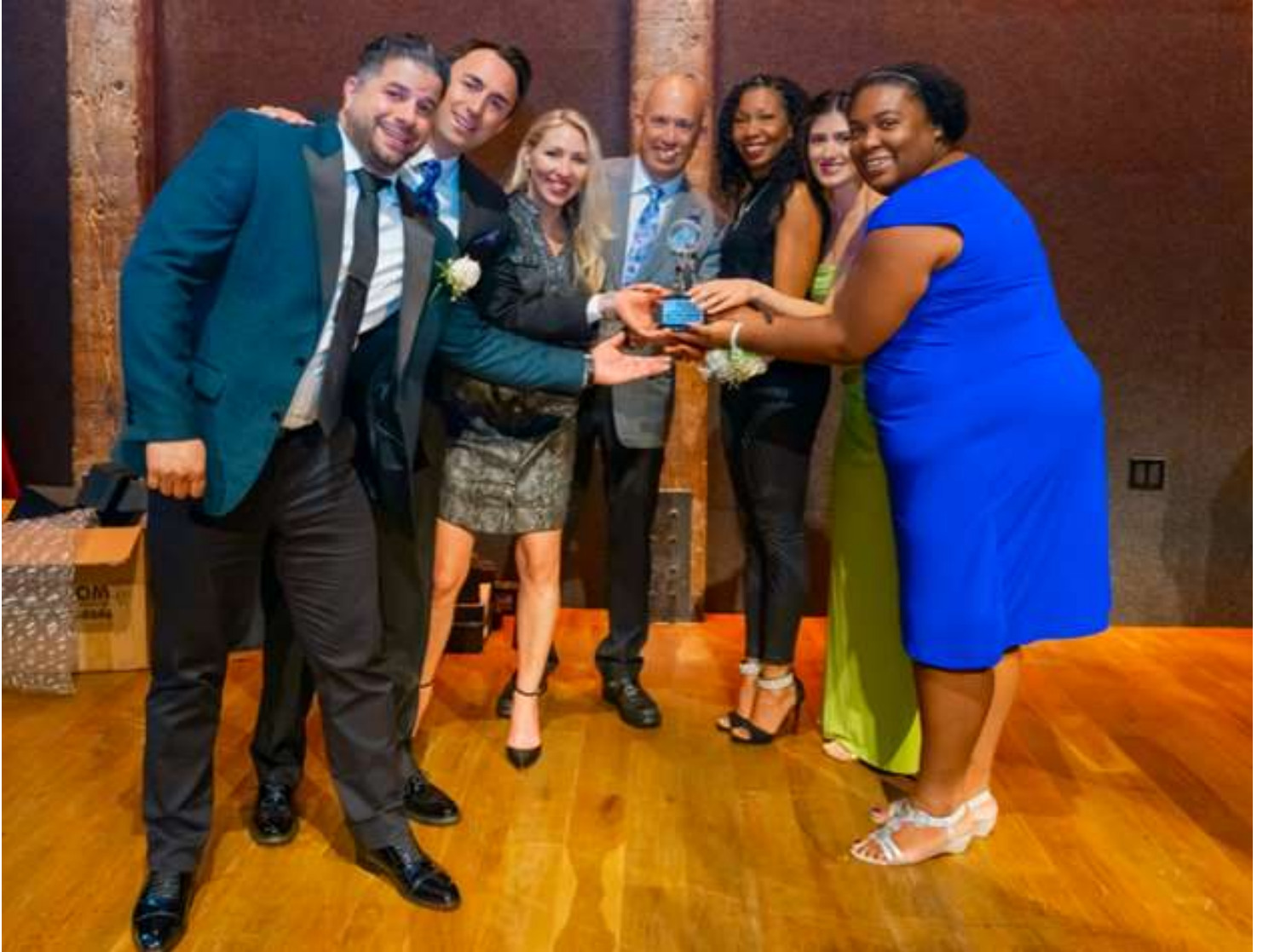
Lions Pride Leadership