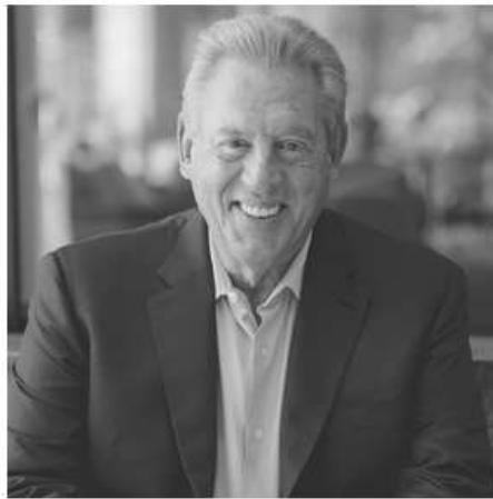
JOHN C. MAXWELL