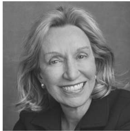
DORIS KEARNS GOODWIN